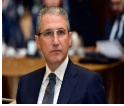
Mr Mukhtar Babayev - Minister of Ecology and Natural Resources of the Republic of Azerbaijan